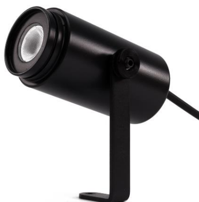
StarEye Midi on bracket (included)