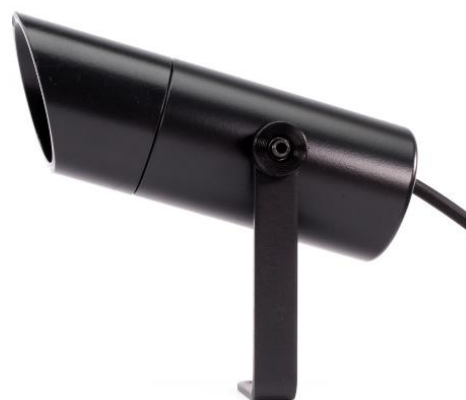
with snout (optional)