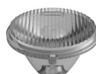
13 x 33° Elliptical