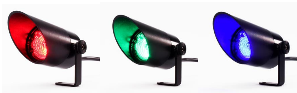
with snoot (optional) Red, Green, Blue coloured light output