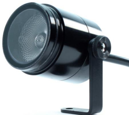
StarEye Mini RGBW spot on bracket