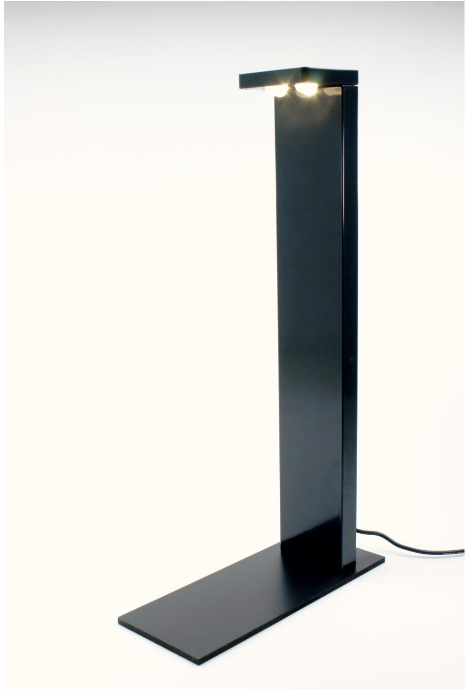
StarWay path luminaire