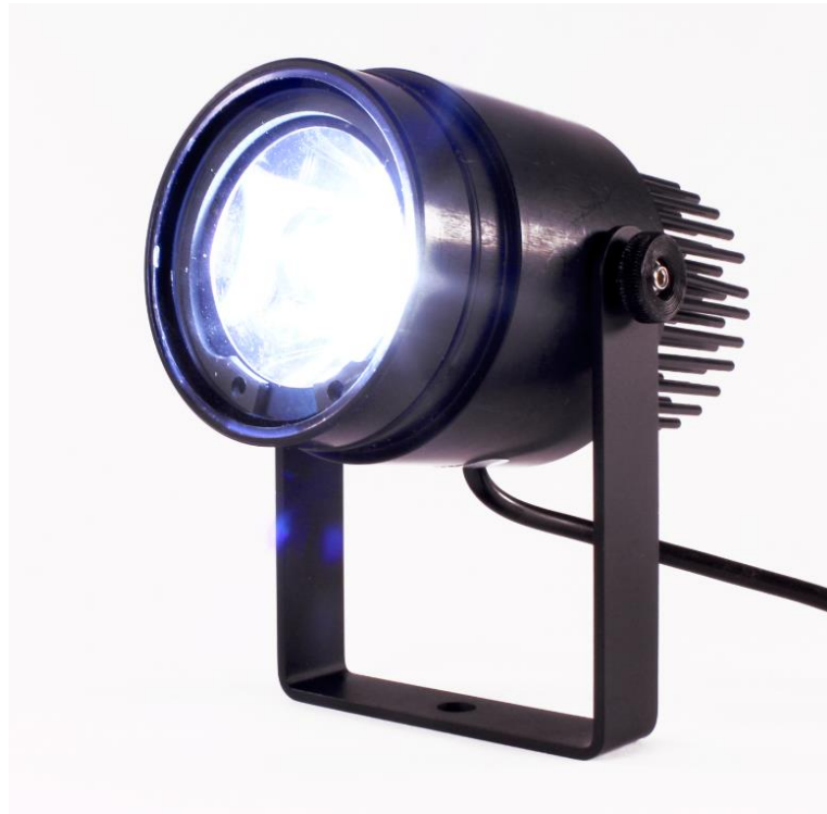
StarPoint 8° on bracket