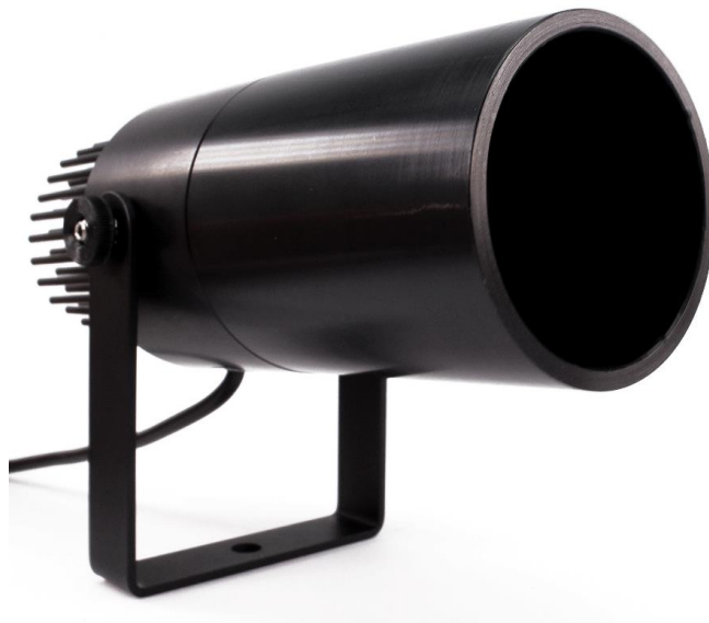
StarPoint 8° with snoot